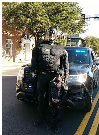
A cute little Batman spots the real HPD Batman during Treats On The Streets

October 27 th , Scarecrow Contest Winners announced and awarded